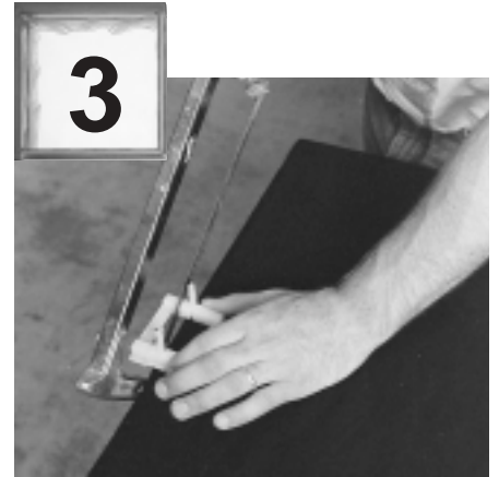
Cut the two "T" connectors where indicated as per diagram.