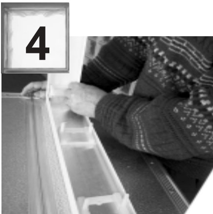
Place a cut "T" connector in the bottom corners of the frame on top of the sill infill, with the open end against the expansion material.