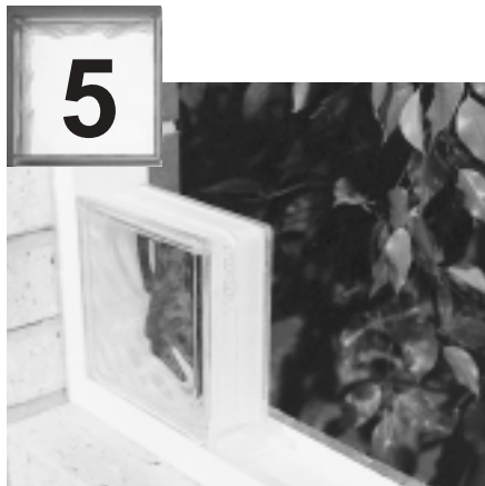
Place the first row of glass blocks in the frame sill, supporting and spacing each block with a "T" connector.