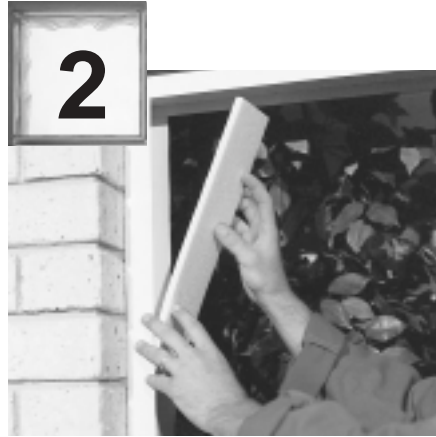
Place the Ezylay expansion material in both verticals of the Ezylay frame ensuring it extends from top to bottom.