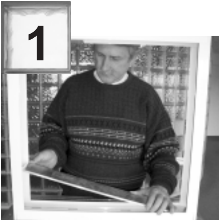
Place sill infill in bottom of frame.