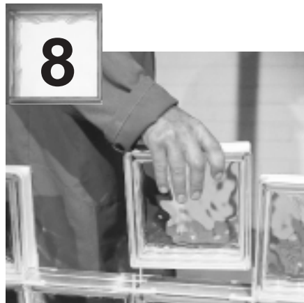
Place the next row of glass blocks and then repeat steps 5, 6 and 7 until one stiffener bar and one row of blocks remains to be installed.