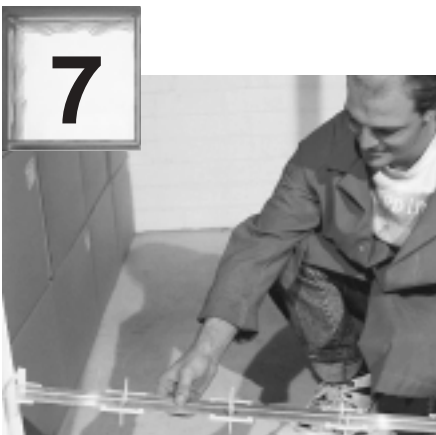
Place the stiffener bar, with connectors, onto the first row of glass blocks.