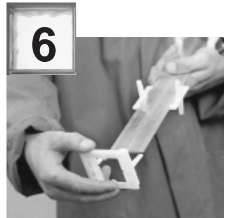
Snap the required amount of "X" connectors onto the stiffener bar and one "T" connector on each end.